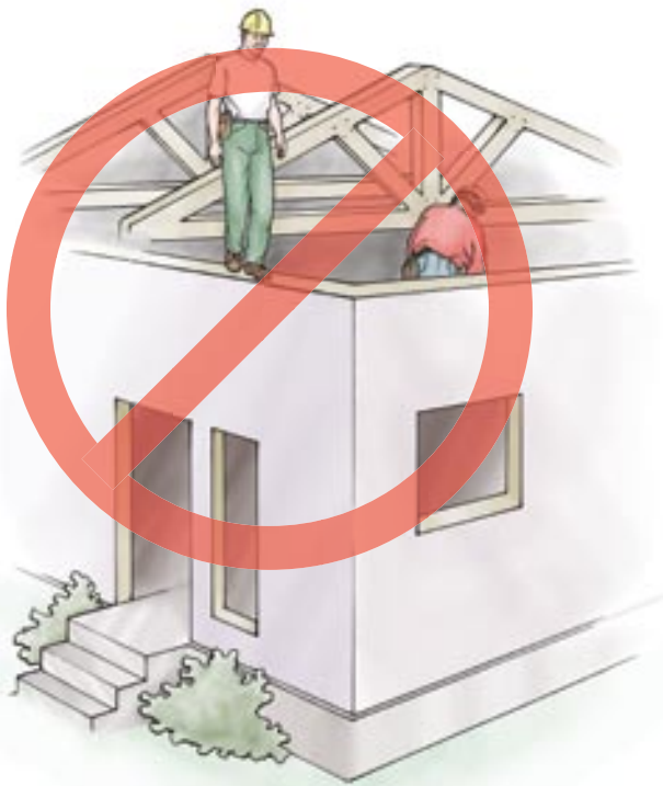
Workers must not walk on top plates of walls.