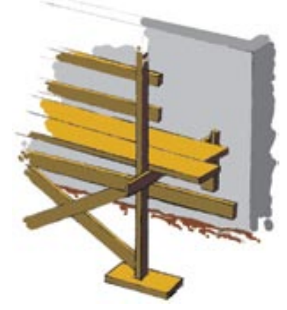
Guardrails are required when the work platform is 3 m (10 ft.) or more above grade.