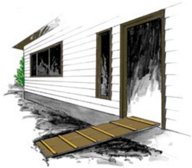
The slope of work platforms must not exceed one vertical to five horizontal. Slope work platforms must have cleats spaced no more than 400 mm (16 in.) apart or a non-skid surface.

Workers must be prevented from falling when working 3 m (10 ft.) or more above grade. Standard guardrails or fall protection equipment must be used for this purpose.