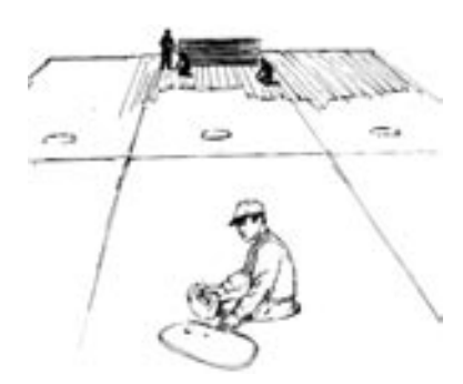
The flotation compartment of a barge is a confined space that may not have enough oxygen to sustain life.